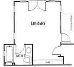
OPTIONAL LIBRARY AT BEDROOM 6